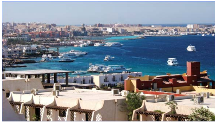
The View from the apartment

But we are here to dive. The bus picks us up on Saturday morning at 8.30am. 5 minutes later we are at the dive centre. We register, load our kit into crates and board the boat. It is brilliant- there are only 7 of us on this large boat, which means plenty of room for kitting up. This