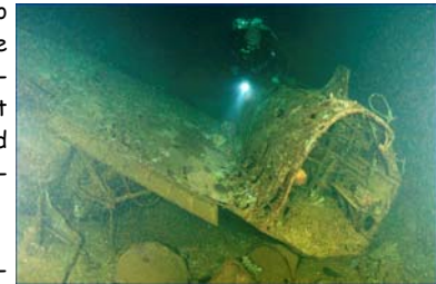
Zero fuselage, Fujikawa Maru

"Fujikawa Maru", with its extraordinary engine room and tool shops, complete with lathes, drill