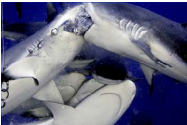
Shark feed, Pizion Reef

the immaculately kept engine room in the "Kensho Maru", complete with mercury filled thermometers,