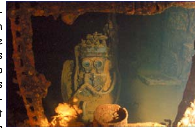
Compressor, Fujikawa Maru

experience a moment of history, frozen in time. None of us will easily forget the magnificent