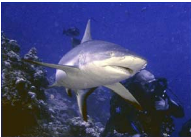
Up close and personall

Truk wasn't all about chunks of old metal. Every wreck has turned into a glorious artificial reef, smothered in hard and soft corals, and