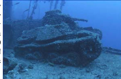
Battle tank, San Francisco Maru

Our trip ended on the peculiar note in which it had started- we were rather unceremoniously evicted from the "Odyssey" at 7.00am, and dumped on the same palm fringed beach, where we had last