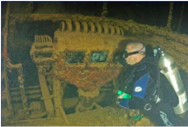
Transfer pump, Kiyozumi Maru

"Nippo Maru", pointing wildly skywards; the inclinometer and precision clock in the engine room of the "Rio de Janeiro Maru" ( the