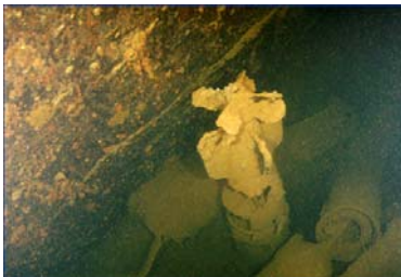
Long lance torpedoes, Heian Maru

The "Odyssey" is sumptuous and can only be described as a floating hotel. The en-suite