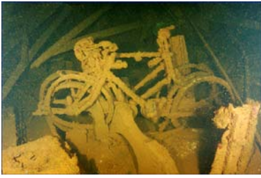
Bicycles, Kiyozumi Maru

binnacles and helm wheels. Particularly memorable highlights were the torpedoes and periscopes on the submarine tender, the "Heian Maru"; the crews' bicycles