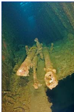
Periscopes, Heian Maru

A large saloon hosts the most amazing culinary experiences, as each meal tries ( and normally succeeds ) to surpass the