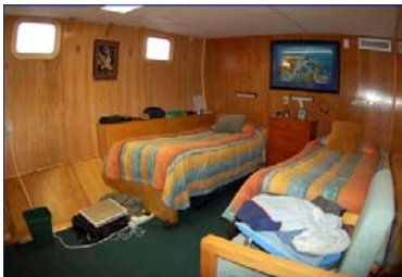
Cabin 8, the "Odyssey"

landing craft before chugging out into the bay. And there, flooded in light was the "Odyssey".