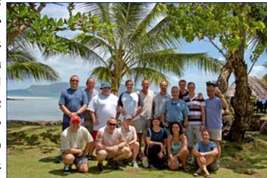
Adventure Divers waifs and strays

Thanks to Touche the Brave, who organised this adventure nearly 2 years ago; Cinder's; Shrek and Donkey,