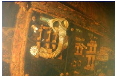
Engine room, Fujikawa Maru

Protected by a strictly enforced conservation order, the wrecks abound with crockery, sake bottles, gas masks, bullets and bombs, fire