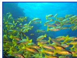
Gazillions of fish