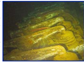
Engine on "Giannis D"

a 15 month drought from blue water diving. A second dive slowly turned into a night dive, which was followed by a night dive proper. Overnight we steamed up to Abu Nuhas, to dive the wrecks of the "Carnatic", "Giannis D" and "Marcus". The "Carnatic" is a truly classic dive, and was made even better when I climbed into the zodiac to find that this time I was only a passenger! I got a real buzz out of visiting the engine room of the "Giannis D"-even I couldn't get this one going!