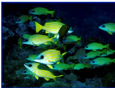
Five-line snappers, Mauritius Dec 04 Ant Collins