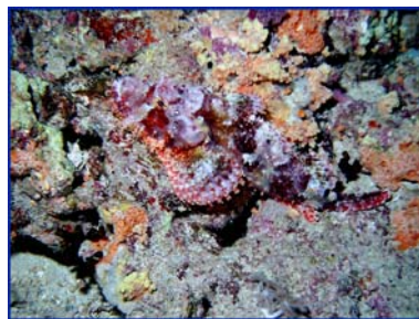
Flathead scorpionfish, The Brothers Sept 04 Ant Collins