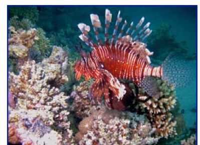
Common lionfish, The Brothers Sept 04 Ant Collins