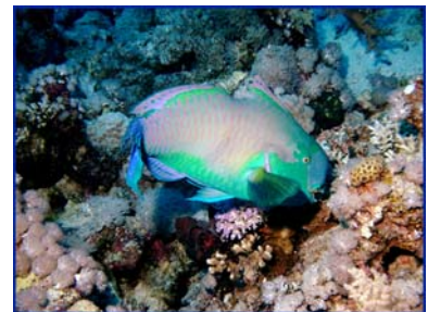
Steepheaded parrotfish, The Brothers Sept 04 Ant Collins