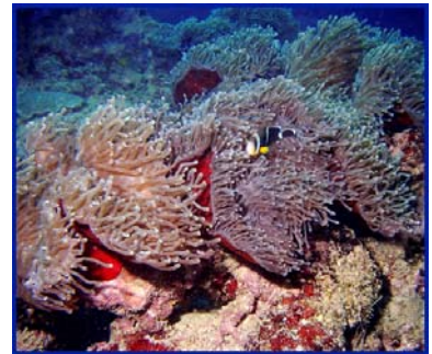
Mauritius clownfish on superb anemone, Mauritius Dec 04 Ant Collins