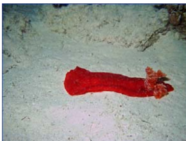
Spanish dancer, The Brothers Sept 04 Ant Collins