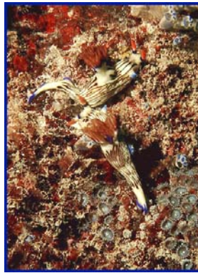
Lined neon slugs, Mauritius Dec 04