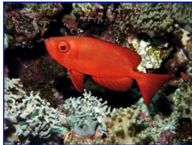
Common bigeye, The Brothers Sept 04 Ant Collins