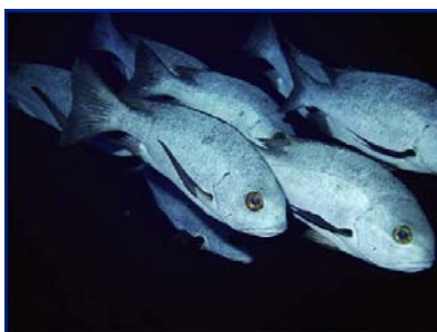
Black and white snappers, Sudan April 04 Ant Collins